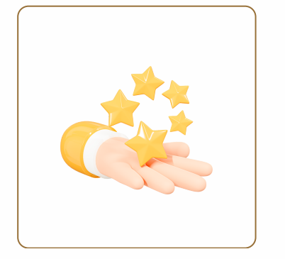
Professional and Reputable Brand