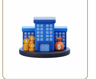
Access to a Thriving Market: